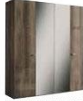
4/D SWINGING WARDROBE (wooden doors) PJMM0013 (with 2 central mirrors) PJMM0014 inch W 78" D 24" H 90" cm L 197,3 P 61,2 H 2 227,5 Crts 8 kg 221/243* m 3 0,76/0,76*