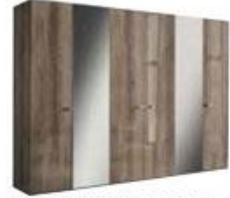
6/D SWINGING WARDROBE (wooden doors) PJMM0017 (with 2 mirrors) PJMM0018 inch W 116" D 24" H 90" cm L 295 P 61,2 H 2 227,5 Crts 10 kg 319/341* m 3 0,98/0,98