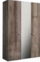
3/D SWINGING WARDROBE (wooden doors) PJMM0011 (with central mirror) PJMM0012 inch W 58" D 24" H 90" cm L 148,5 P 61,2 H 2 227,5 Crts 8 kg 183/196* m 3 0,68/0,71*